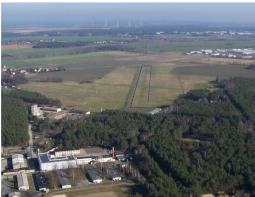
View of the airfield from western direction