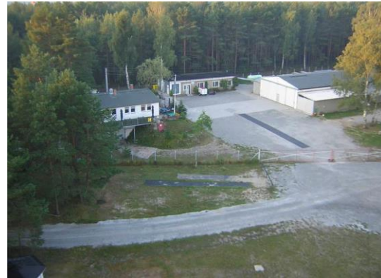
Clubhouse, hangars and sanitary facilities